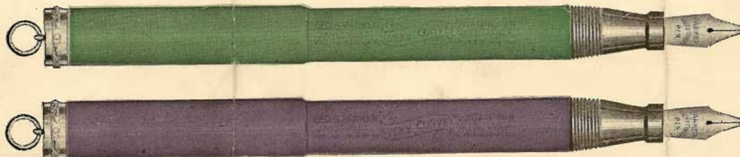
Ivoryne with gold mounted inner cap and ring. No. 66 (2 point), $5.00; No. 67 (3 point), $5.50

Parker Washer Clips Gold Filled, 75c; Nickel, 25c